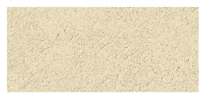
Stolit MP Range - Coloured fine finishing render that can be floated, sponged or applied as a light adobe render.