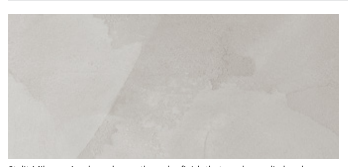
Stolit Milano - A coloured smooth render finish that can be applied and styled to duplicate the natural surface of precast concrete panel.