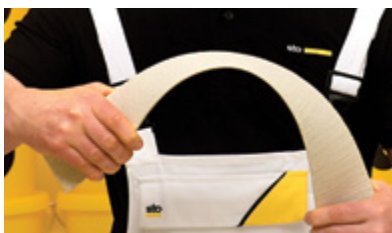
A bend test demonstrating the extraordinary elasticity and resulting high-crack resistance of StoArmat render.

Installations are carried out by a Sto Registered Licensed Building Practitioner with the added protection of a StoArmat 20 Year Warranty and StoService Assurance, guaranteeing building code compliant materials are used and application meets building code standards, including a service plan for long-term security.