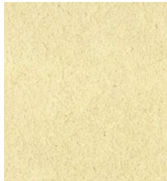
Stolit MP: Coloured fine float, sponge or light adobe finishing render.