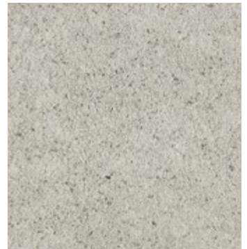
Stolit MP Natural: Coloured fine finish float, sponge or light adobe sand speckled finishing render.